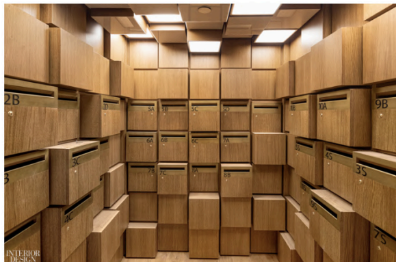
Jardim includes several surprising touches throughout, such as this subtly rustic mailroom. Photography courtesy of Evan Joseph.