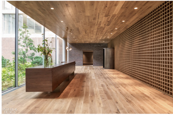
Jardim's lobby blends seamlessly with its surroundings and includes a lattice-work wood screen, as well as panoramic views of the interior garden.