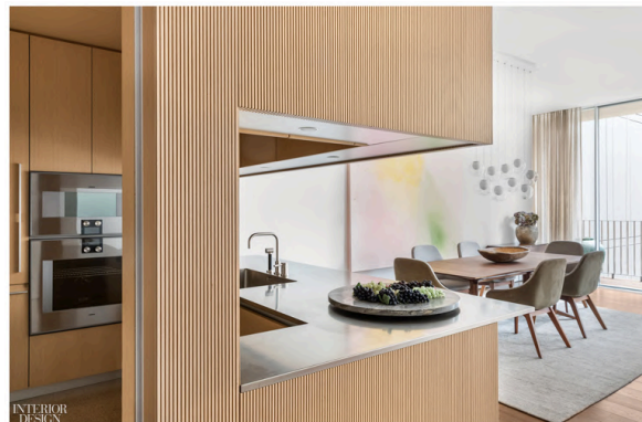
The kitchens feature tabac terrazzo flooring and light oak custom cabinetry by Molteni with custom finish hardware.

The al fresco cocktail event, hosted by Centaur Properties LLC and Greyscale Development LLC—the development groups behind Jardim—included a tour of a model unit furnished by the architect and designer and featuring some of his custom pieces. Weinfeld, an Interior Design Hall of Fame member , and his team created and designed the 36-unit, plant-filled complex, named to reflect the Portuguese word for garden.