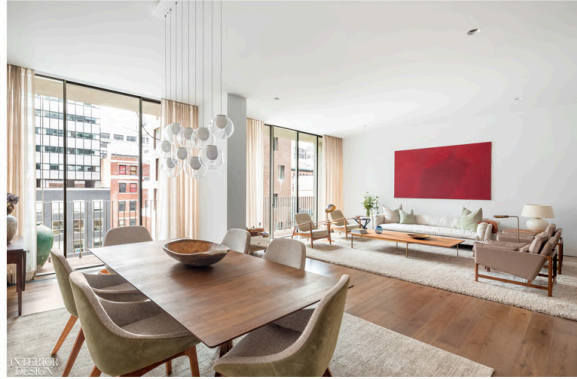
A look at one of the units in Jardim.

Earlier this fall, Isay Weinfeld , the world-renowned Brazilian architect and interior designer, mingled with a group of real estate brokers during a cocktail reception in the West Chelsea neighborhood of Manhattan. Weinfeld, who has the modest demeanor of a university professor, seemed content as he floated from one person to the next, taking time to compliment musicians in the live band between sets. The occasion? The much anticipated unveiling of Weinfeld's first U.S. project—a boutique residential building overlooking the High Line called Jardim.