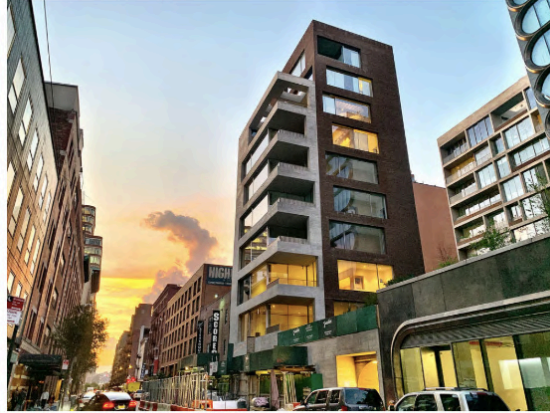
Recent photo of Jardim's south building

Jardim's name was taken from the Portuguese for "garden," which is exactly what the two-building development is surrounded by. Designed in collaboration with Future Green Studio , the dense greenery features native evergreens, fragrant flowering trees, indigenous shrubs, and lounge areas with layered plantings of long-blooming perennials. A stone-faced staircase leads to the garden, which can also be seen through a latticed wall in the lobby.