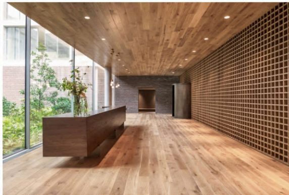
All images of Jardim